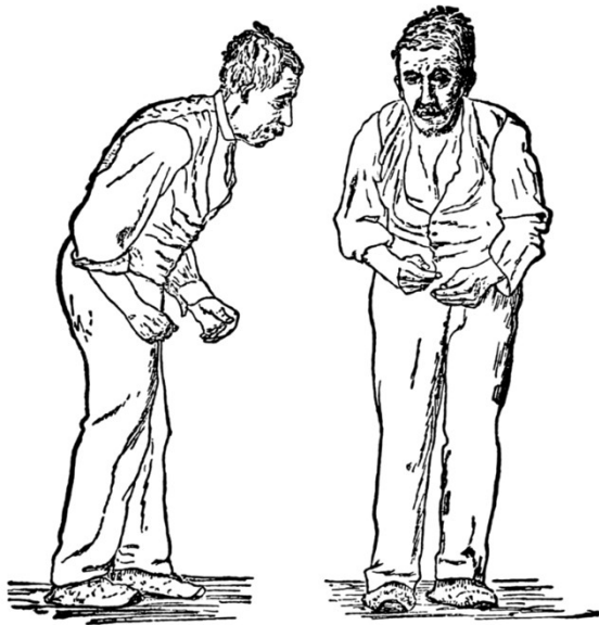
Sir William Richard Gowers, 1886